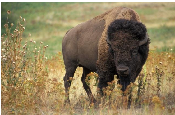
Figure 4. American bison

While we commonly think that these large wooly creatures at the Pawnee Bill Ranch are buffalo, they are actually American bison, their species name being bison bison . Buffalo are actually not found in America but are indigenous to South Asia and Africa, and do not resemble the animals we have in North America. The two names have been used interchangeably, and bison have been colloquially known as buffalo throughout history. Referring to bison as buffalo is a common error, adding to the confusion.