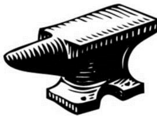
Figure 2. Anvil