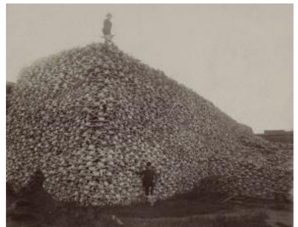
Figure 6. Bison skulls waiting processing in 1892

Due to this pattern, the ability of a hunter to kill one bison often led to the destruction of a large herd. For plains settlers, bison hunting and trading buffalo fur provided economic security. Commercial bison hunting emerged, and professional hunters made a far larger impact on the decline