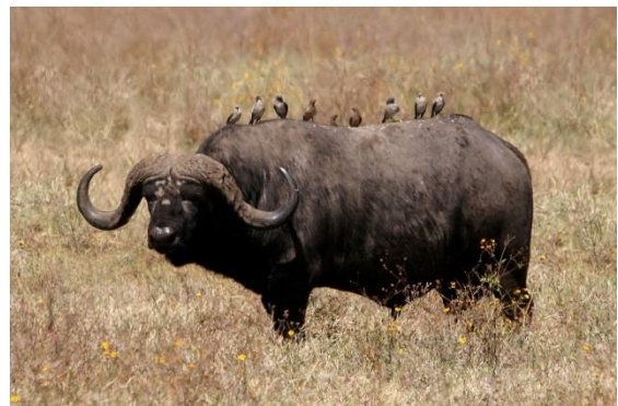
Figure 5. African buffalo

An easy way to distinguish between the two is the hump and the horns. Buffalo do not have a hump, while the bison have one on their shoulders. Buffalo tend to have large horns, which have a very pronounced arch, while the American bison has smaller horns. Finally, bison tend to have large, thick beards, while buffalo are beardless.